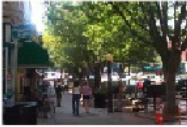
Green Streets mean 4.00 (sd 0.60)