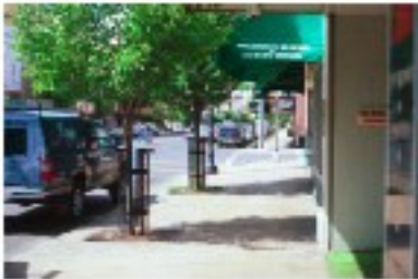
Enclosed Sidewalk mean 3.32 (sd 0.83)