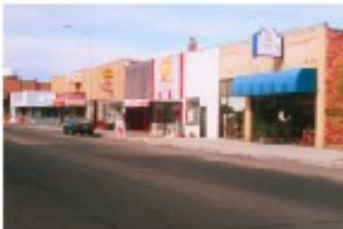
No Trees mean 1.65 (sd 0.72)

the array of category content evaluated and the mean responses (with standard deviations) across the main street studies. Figure 10-1 shows sample category images.